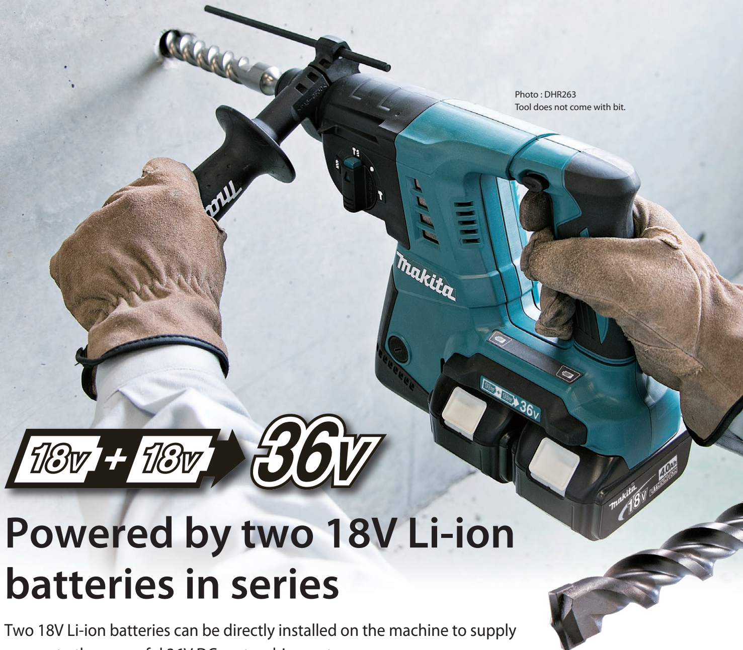
Photo : DHR263 Tool does not come with bit.

Dust cup (option) can be attached using adapter. (for DHR263 only)